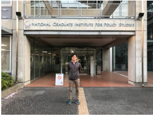
(a) Picture taken in front of the main entrance of the GRIPS